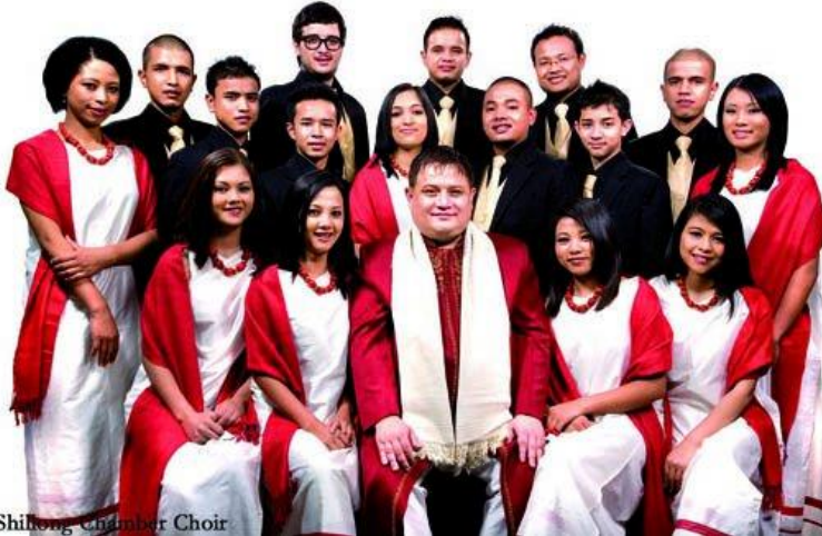
Shillong Chamber Choir

The Shillong Chamber Choir is a group of young singers from the little town of Shillong, tucked away in the picturesque hills in North-East India. They first made an impression with the rest of India when they performed on the popular television music competition, 'India's Got Talent' in 2010. Competing against many talents from all over India, they stole the hearts of the judges and the national and international viewers alike and won the first place. Thereafter, there was no looking back as they reached out