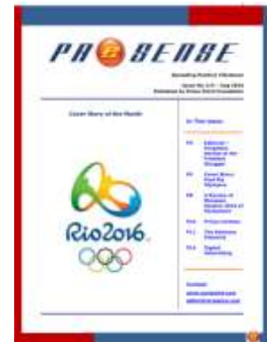
PreSense 114 th (Aug 2016) cover page

To promote the concept of 'positive journalism' given by Dr Abdul Kalam, he started publishing two monthly e-magazines, viz. 'PreSense' in English and 'New Gen Thamizhan' in Tamil. He is the Editor in Chief of these two eMagazines. So far, 114 monthly editions of PreSense and 32 monthly editions of New Gen Thamizhan have been published till August 2016.